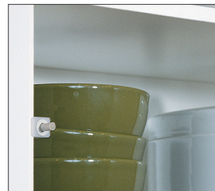
For surface mounting