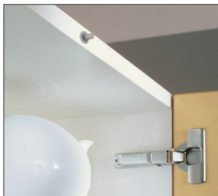
For recess mounting