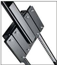
Counterbalance weights with extension plates